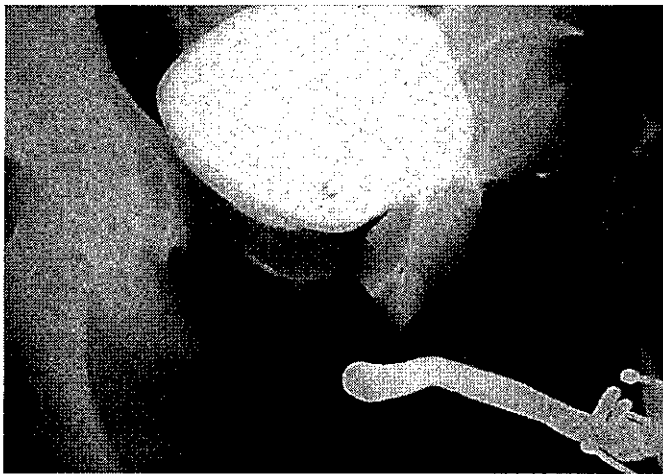
FIG. 1. Simultaneous retrograde urethrogram and voiding cystourethrogram 2 months after acute straddle injury leading to complete urethral disruption. Proximal extent of stricture is not identifiable with certainty.